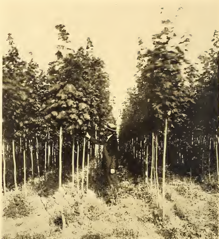
Some of Our Young Norway Maples